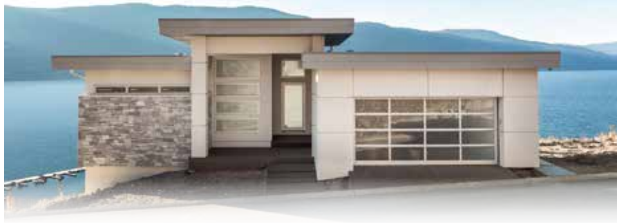
Mullins designed Link Custom Home