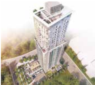
PRIME, SURREY, BC