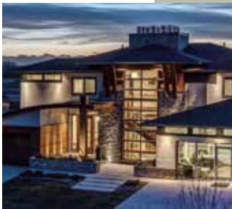
WATERMARK, CALGARY, AB