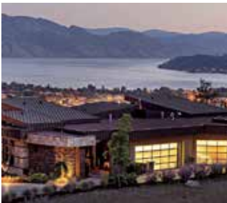
HIGHPOINTE, KELOWNA, BC