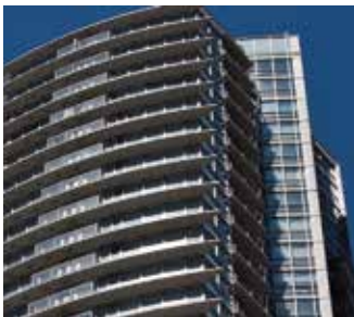
CAPITOL RESIDENCES, VAN, BC