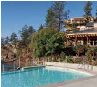
OUTBACK, OKANAGAN LAKE, BC