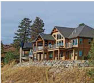
THE LAKES, LAKE COUNTRY, BC