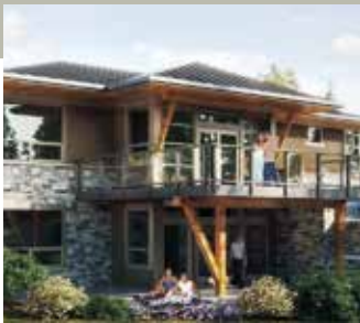
VILLAS AT WATERMARK, CALGARY, AB